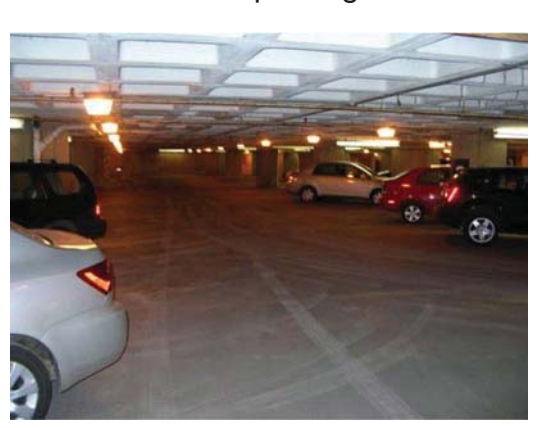
Overview of Western Psychiatric Institute & Clinic parking structure level 2

The Western Psychiatric Institute and Clinic parking structure presented StructureTec with many challenges. One of the primary challenges was prevalent on levels two, three and four of the parking struc-