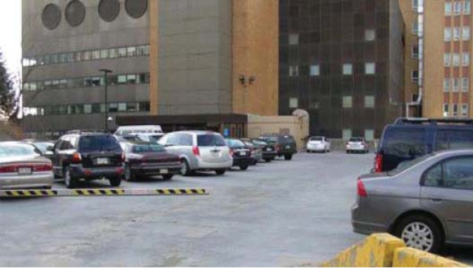
Partial overview of level 5 of the parking structure