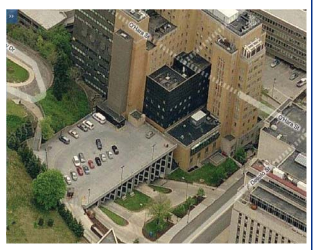
Overview of University of Pittsburgh Medical Center - Western Psychiatric Institute & Clinic parking deck

ture. There was the potential for fall/life safety hazards from spalled/cracked concrete, which required immediate attention.