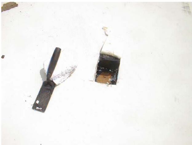
Test cuts revealed overall construction. Retrofitting had occurred and existing insulation appeared saturated.

mised by the wet insulation from the time of installation. As a result, the majority of these retrofits were less than ten years old and had already experienced premature failure. Of the buildings surveyed, over 50% of the roofs required major remediation or replacement within the next five years. An additional challenge arose from the fact that the district had a very limited initial budget and lacked the funds to address all of the immediate areas of concern. Areas which could be restored through remedial repair and replacing wet insulation were delineated. The Survey's scientific approach and accuracy allowed School District U-46 to pinpoint and prioritize