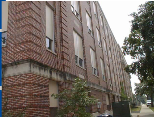
Overview of Central Alternative High School

These services were performed to determine how much wet insulation was present and how much previous degradation had occurred. The Survey included performing a "state-of-the-art" infrared scan on the low slope roof areas. Results were recorded on a VHS tape for review. All deficient areas were marked on the roof surface and random test cuts were taken for verification. Schematics were developed for documentation and future contractor bidding. This process revealed that the majority of the roofs exhib-