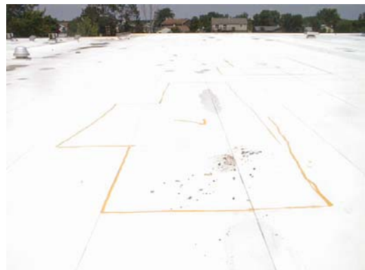
Overview of mechanically attached single-ply membrane assembly.

ited retrofit roofing, whereby single-ply roofing was installed directly over the existing built-up roofing. In the retrofit process, the existing wet, saturated insulation and substrate had not been addressed. This was compounded by the fact that the retrofits were mechanically attached and therefore had been compro-