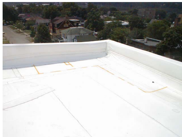
Overview of wet insulation identified during the StructureScan survey.