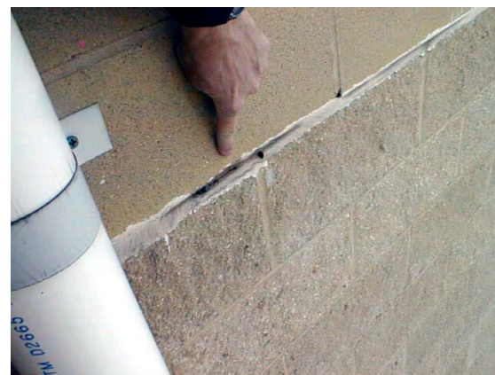
Previous sealant repairs had been performed at the joint between the standard masonry block and the split face masonry block. The weep holes have been plugged with sealant at various locations.

employed to determine the areas of water ingress and the path of water migration. Ritem tube tests were also employed to determine the porosity of the masonry block and mortar. Limited destructive testing and boroscope analysis were performed to determine the existence and condition of through-wall counterflashing systems, which were ultimately determined to be deficient. StructureTec then developed recommendations for correcting the deficient construction. The original contractor was contacted to correct all the deficiencies. StructureTec designed new flashing and terminations at the base of the walls. Recommendations for the removal and