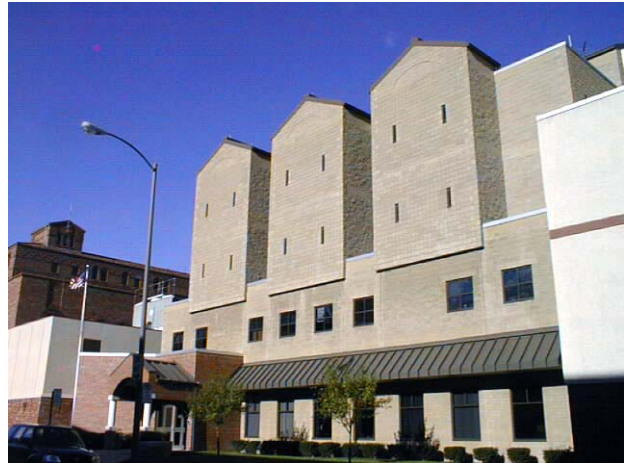
Overview of the building, which is constructed of split-face masonry block as well as standard masonry block and brick.

sual inspections of the building and reviewing the original construction documents. Flood testing was then