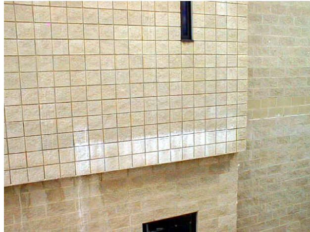
Efflorescence is observed due to moisture ingress into masonry wall, primarily concentrated near wall weep system.